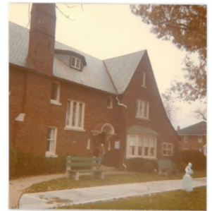
Mansfield Memorial Homes, 1974

The vision was to build strong local agencies on aging whose boards could be effective advocates with county, city, and township officials. These offices on aging were located, whenever possible, in senior centers. The agencies were designated as focal points, and most were multipurpose senior centers, operating Information and Referral services, transportation and escort services, providing congregate and home-delivered meals, client-finding services and offering a variety of social, recreational, and educational service programs.